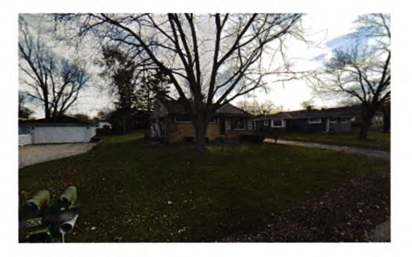
819 Evert St