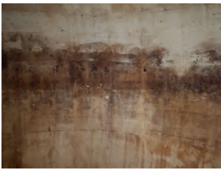
54) The wet interior sidewall coating is in poor condition overall.