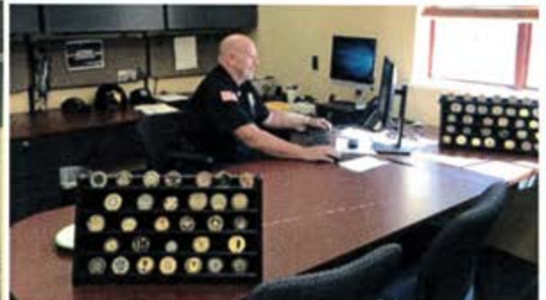
Eleven months after suffering broken ribs, a collapsed lung and bleeding in his brain, this Pewaukee lieutenant is back at work