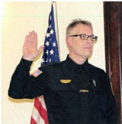
Longtime Milwaukee Police Department member hired as Pewaukee police chief